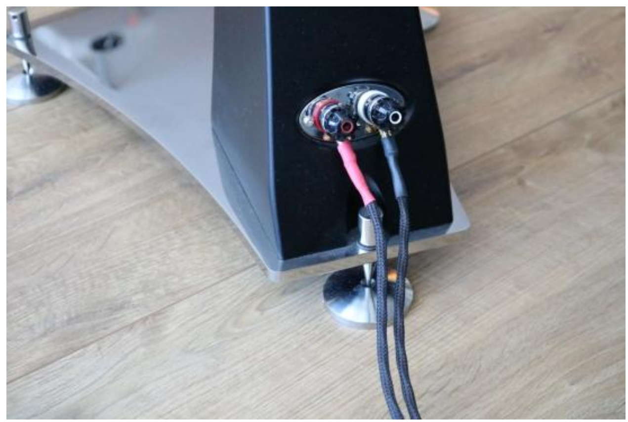
Above: high quality, latest generation, WBT connectors.

Timbrally these speakers are simply super-natural. They sound utterly lifelike, immediately credible and emotionally involving. With these speakers, you won't be hunting for audiophile aspects but you will simply be enjoying the music, certainly when they are driven by a fine tube amp such as the <u>PrimaLuna DiaLogue Premium</u>. As I am writing this I realise that I have not even for a moment thought about listening to the speakers using any of my other amps. That's a bit of a shame really, but alas the speakers are gone now. It does signify the extent of the satisfaction obtained from the Accordo's. They really make you want to listen to music, not fiddle with ancillaries.