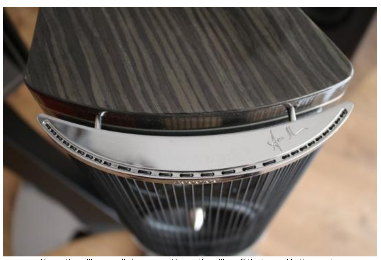
Above: the grill can easily be removed by gently pulling off the top and bottom parts.

When switching back to the Wilsons the main difference is that they are even more neutral and especially more transparent. Naturally, the Wilsons have a much bigger enclosure and double, larger woofers but since I have them set up so that the room contributes much less to their sound via room modes, they sound much smaller than they are, in a good way. And this also brings them closer to the Accordo's, especially when playing acoustic or vocal music. Of course, the Wilsons are easily recognisable when playing.